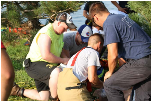
Man drowns in Lake Sule

Tragedy struck when a man was reported missing after swimming into Lake Sule and going under. Rochelle firefighters were able to recover the patient and initiate resuscitating efforts within 73 minutes. The Winnebago Dive Team was called for mutual aid and arrived as Rochelle personnel were attending to the patient. Unfortunately the man did not survive.