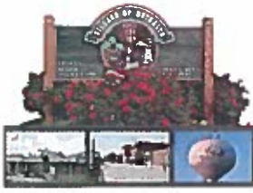
The Village of Bethalto, Illinois Comprehensive Plan January 2014 DRAFT