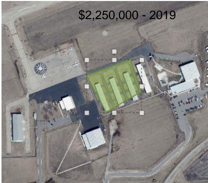
Runway Rehabilitation Airport Fund, IDOT, TIP

A vital component to the City's economic development