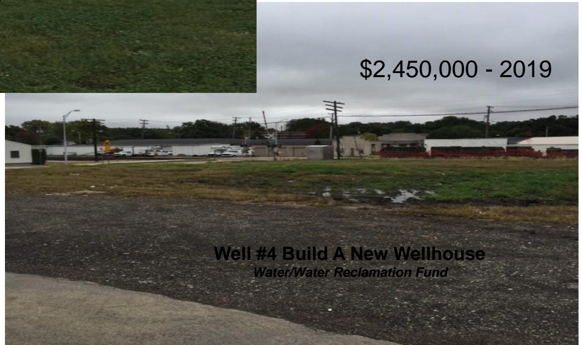
Well #4 Build A New Wellhouse Water/Water Reclamation Fund