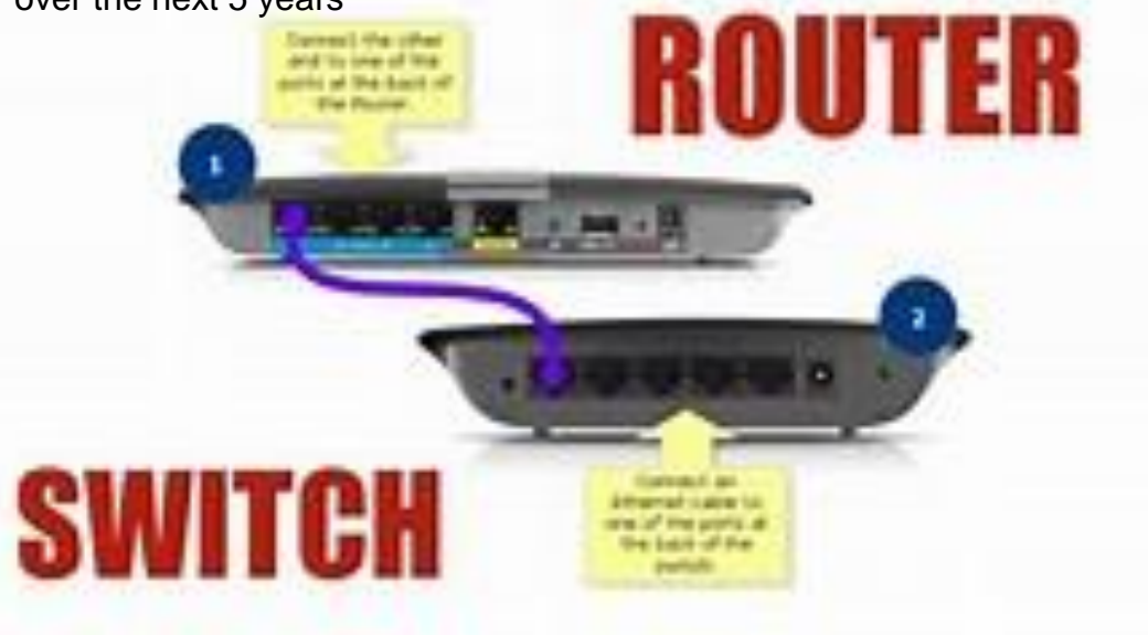
Switches & Routers Communications Fund