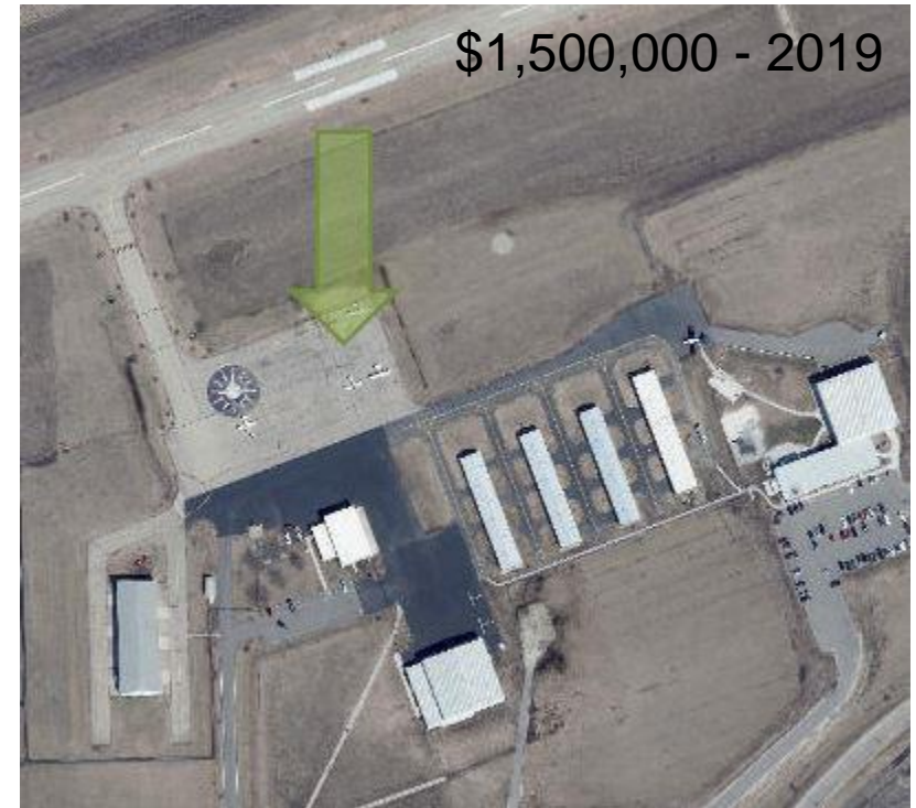
Rehabilitate Existing Ramp – Phase 2 Airport Fund, IDOT TIP