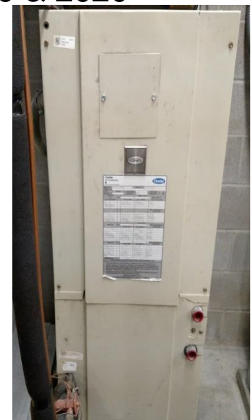
HVAC Replacements Electric Fund & General Fund