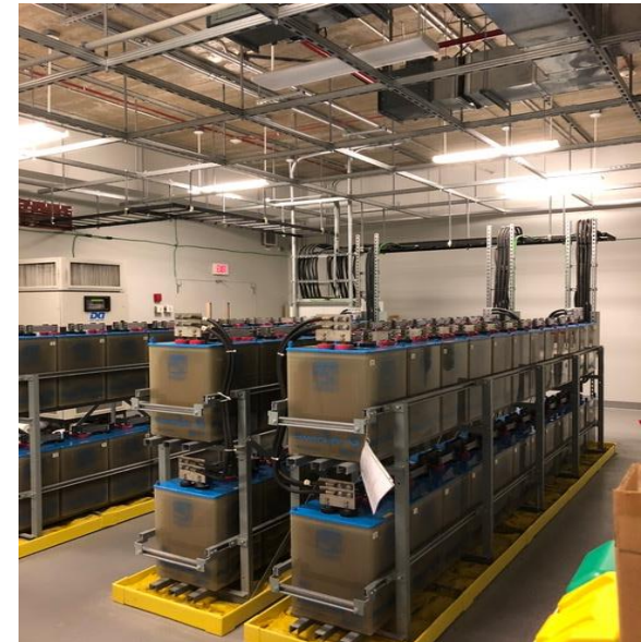
Power Distribution Unit Communications Fund