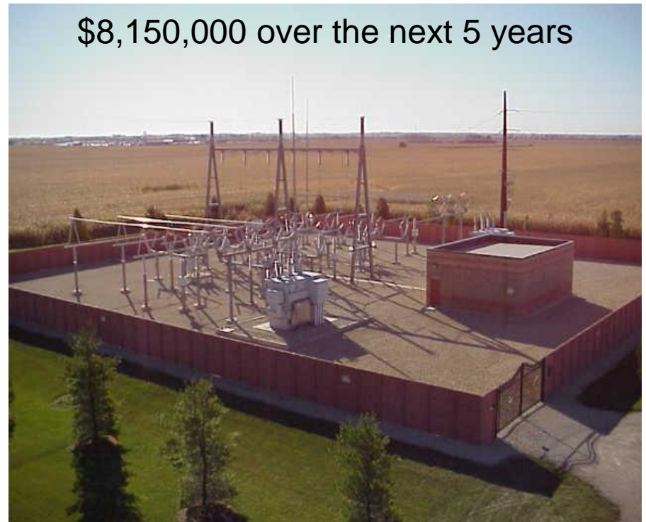
New Feeder to MightyVine Electric Fund