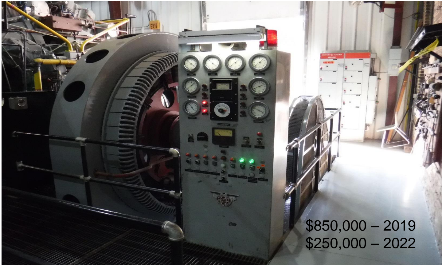
LSV Engine Control Panel Electric Fund