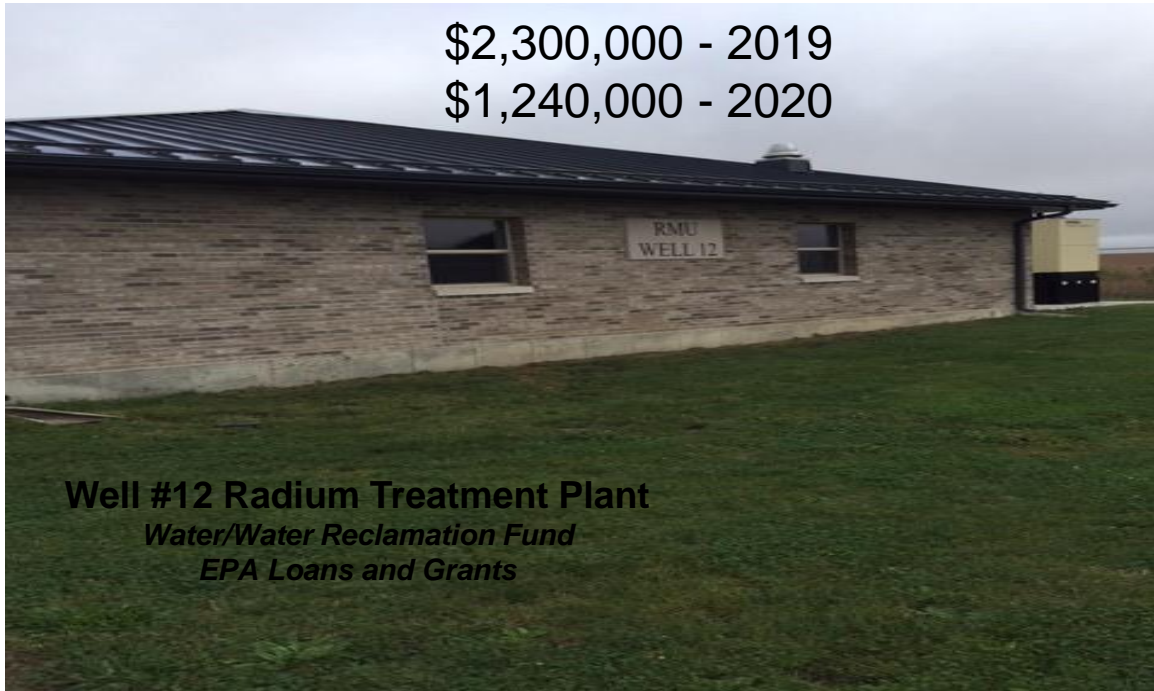
Well #12 Radium Treatment Plant Water/Water Reclamation Fund EPA Loans and Grants