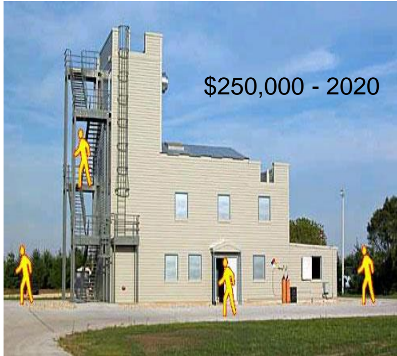
Fire Training Facility General Fund