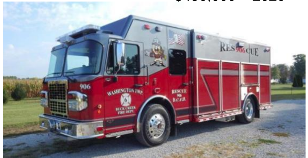
Rescue Engine Replacement General Fund