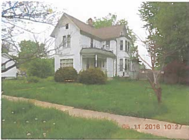
Citation Date: 5-11-16 Fines: None