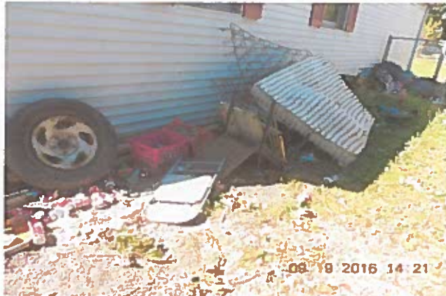
Citation Date: 9-19-16 Fines: None