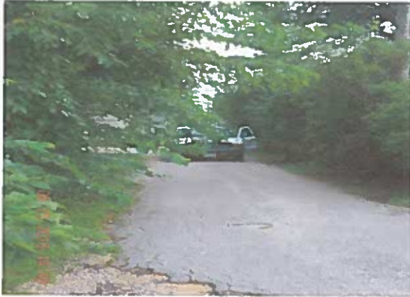
Citation Date: 8-25-16 Fines: None