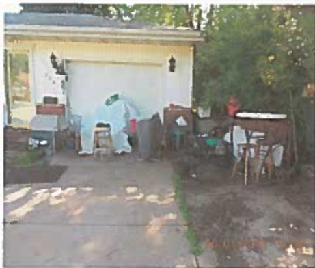
Citation Date: 6-1-16

Status: Business owner was sent citation for debris and was informed on how to dispose of the refrigerator. No action was taken so the business owner was contacted. All debris and the refrigerator were removed from the property.