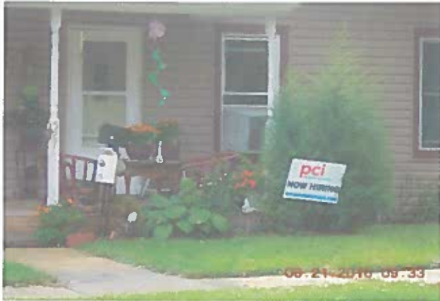
Citation Date: 9-21-16 Fines: None