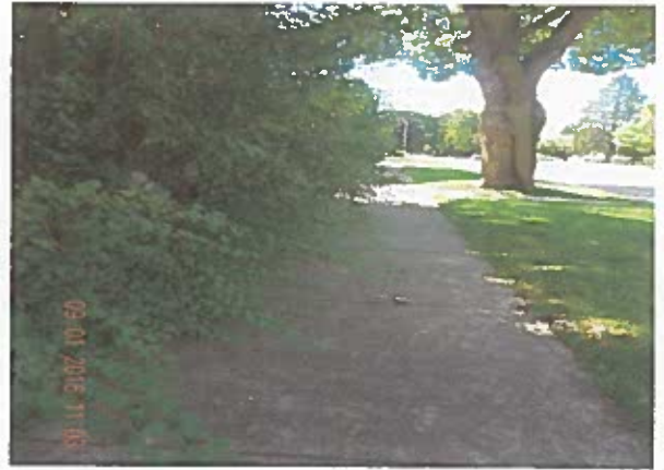
Citation Date: 9-1-16 Fines: None

Status: A citation was issued for trimming the bushes away from the alley. The owner did not comply so a second notice was sent. The bushes were then trimmed.