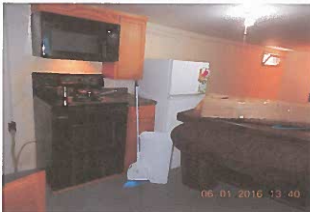
Citation Date: 6-1-16

Status: Tenant was cited for parking the boat on the grass. The tenant failed to comply so a second citation was sent. The tenant still failed to comply so a court notice was issued. The boat was removed by the court date and the case was dismissed.