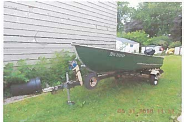
Citation Date: 4-27-16 Fines: None

Status: A citation was sent for the illegal business sign in a residential district. The sign was removed.