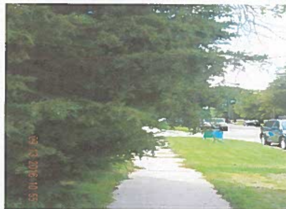
Citation Date: 9-13-16 Fines: None

Status: The resident was cited for trimming the bushes from the public sidewalk. The resident complied.