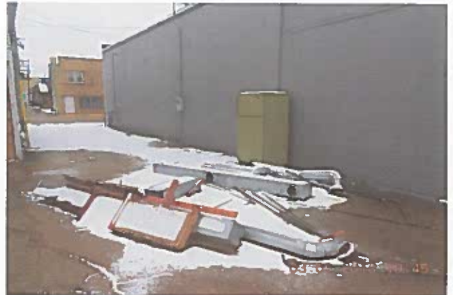
Citation Date: 3-3-16 Fines: None

Status: Resident was cited for debris on property. By the compliance date, all but two items had been removed. A second citation was issued and the remaining debris was removed by the compliance date.