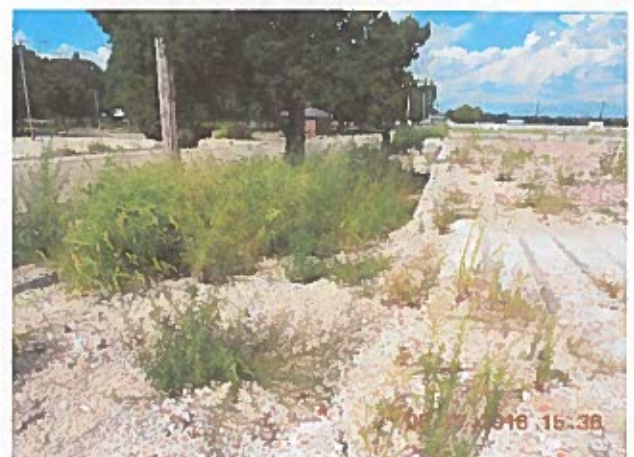
Citation Date: 8-17-16 Fines: None

Status: Landlord and both tenants were cited for mowing the property. By the compliance date, the property was mowed.