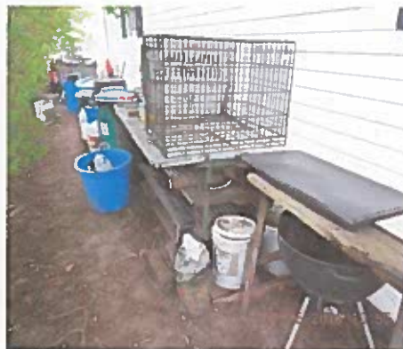
Court Hearings: None