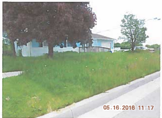
Citation Date: 5-16-16 Fines: None

Status: House is vacant and is part of an ongoing divorce settlement action. Both parties were cited. Each stated they were not responsible for the maintenance but the wife finally agreed to mow it and keep it mowed.