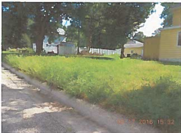
Citation Date: 8-17-16 Fines: None

Status: Owner passed away so house is vacant. House is in the family's name but there was no response to notices sent to the family. A mowing contractor was hired by the city to keep it mowed during the season.