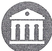
Account Contacts & Locations