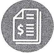
Account & Interest Rate Structure