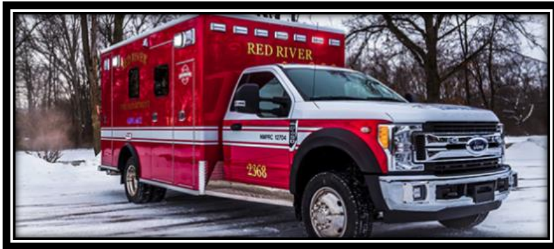
Ambulance 2020: $200,000