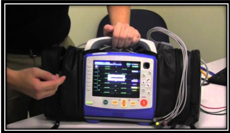
Cardiac Monitor / Defibrillator Replacements 2020: $40,000 2021: $30,000