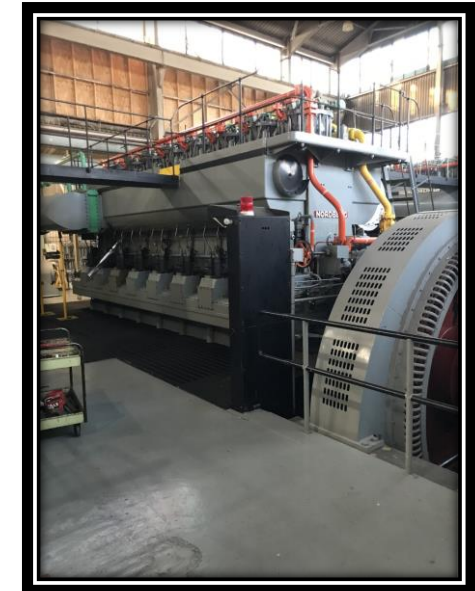
Nordbergs Upgrade 2020: $540,000