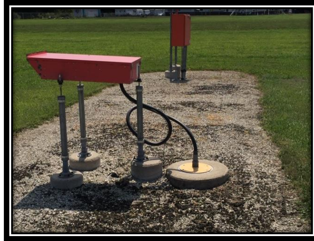
Rehabilitate PAPI Bases 2020: $25,000