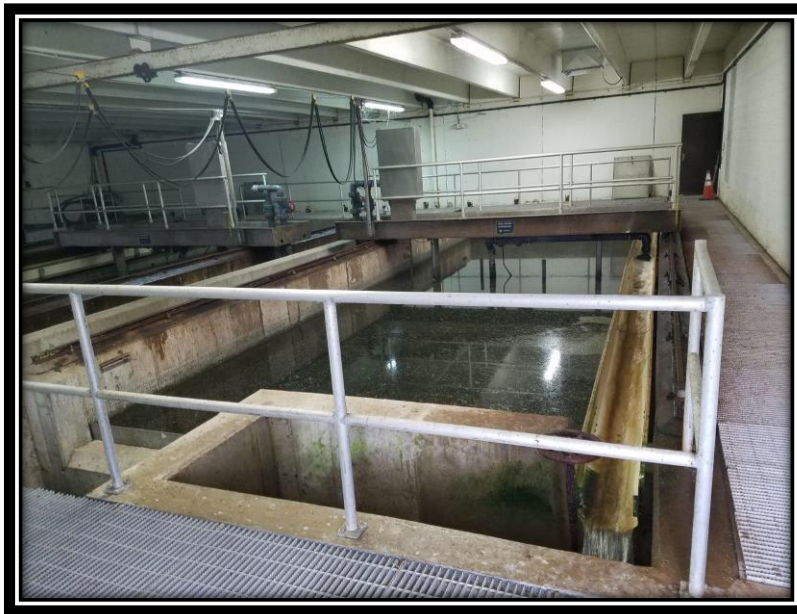
Rehab Sand Filters 2020: $500,000