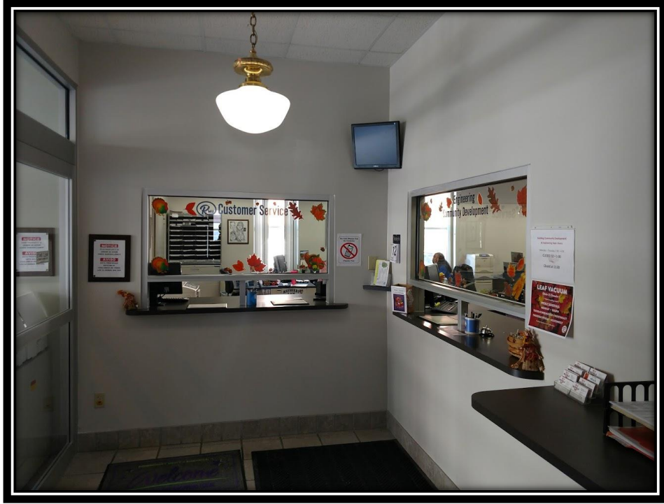
Building Security 2020: $35,000