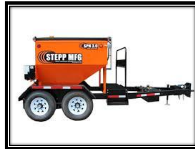
Hot Patch Trailer 2020: $75,500