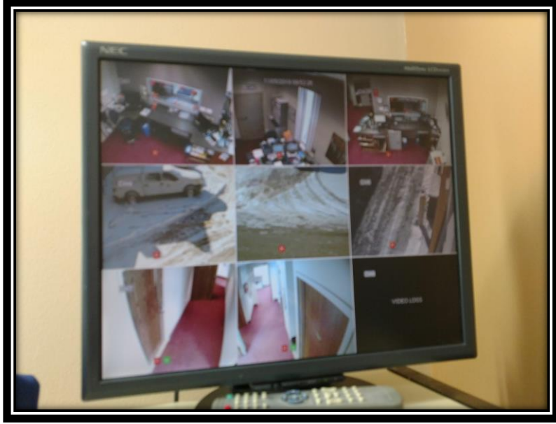
Security Cameras 2020: $7,000