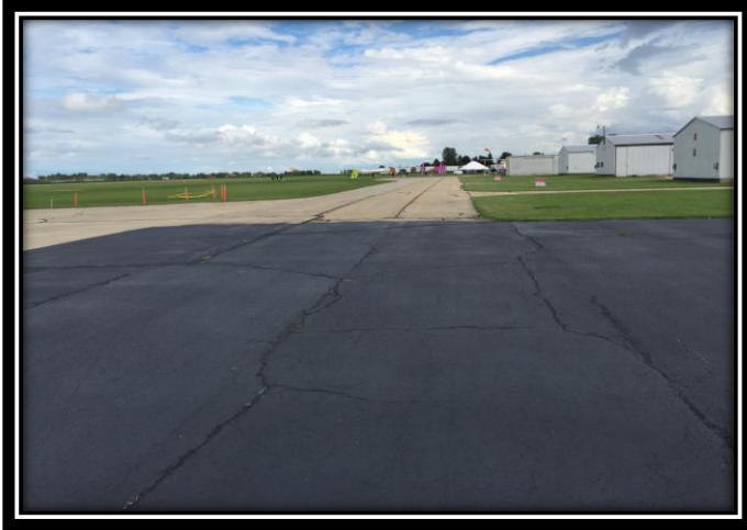
Rehabilitate Access Taxi Ways 2020: $228,000