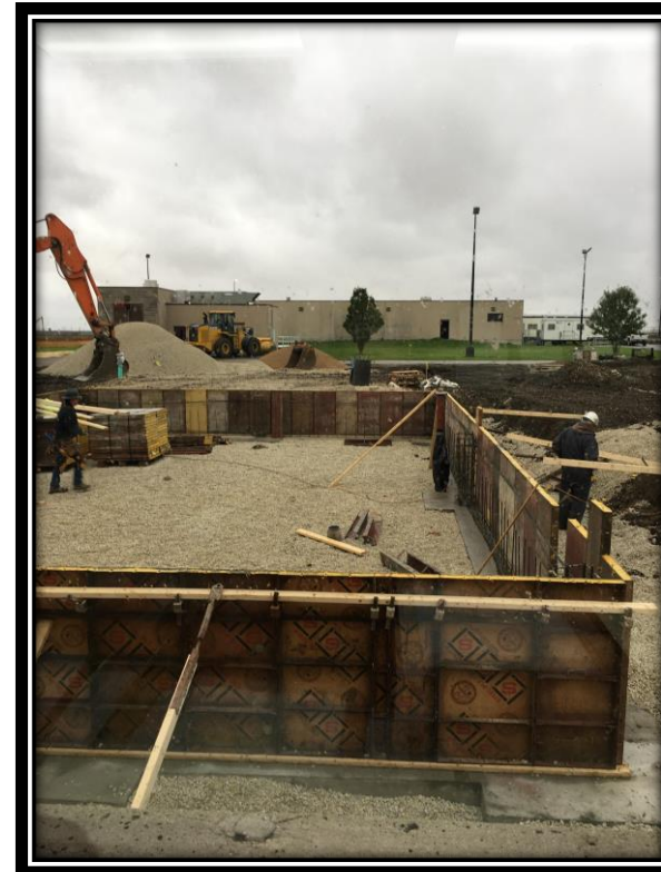
Waste Water Treatment Plant Upgrades 2020: $3,453,262 2021-2029 a total of $10,450,000