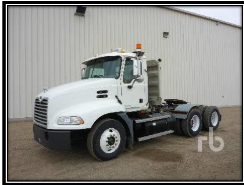
Semi Tractor & Trailers 2020: $60,000