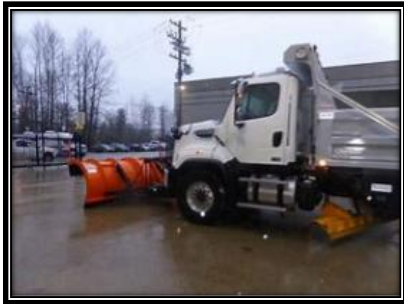
Single Axle Dump Trucks 2020: $86,802 2021-2029 a total of $838,604