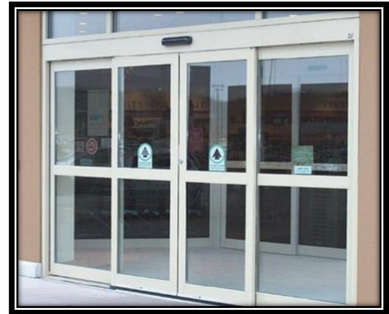
Auto Entrance Doors 2020: $50,000