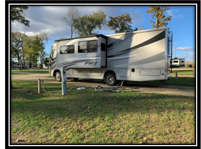
RV Park 2020: $40,000