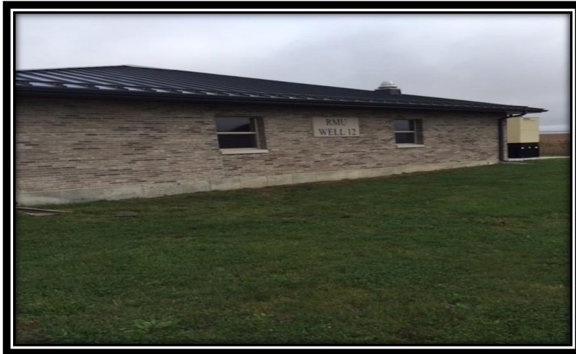
Well 12 Radium Removal Plant 2020: $2,850,000