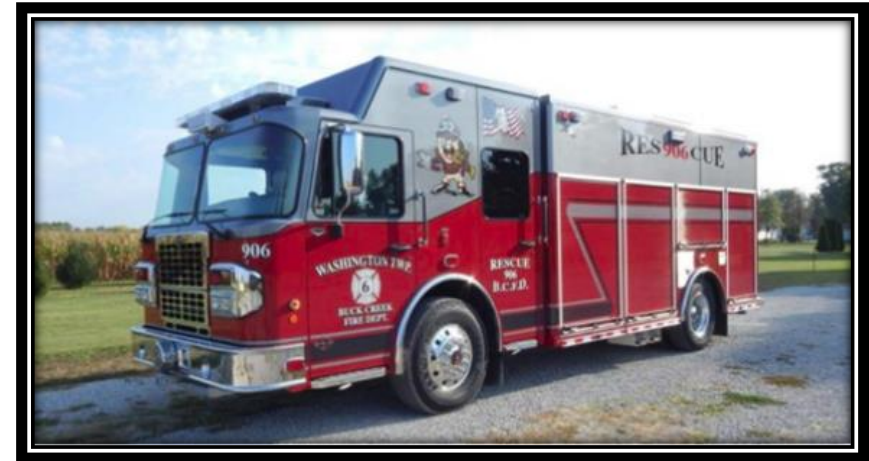
Rescue Engine 2020: $450,000