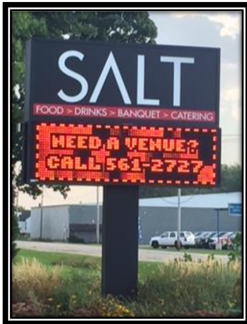
LED Sign 2020: $30,000